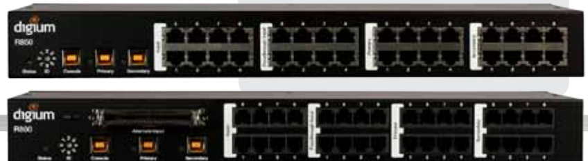
Digium R850 (top photo) and R800